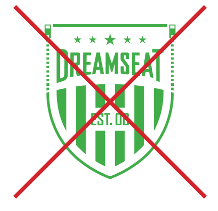
COLORS OUTSIDE OF BRAND