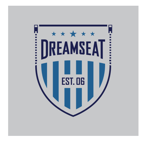
FULL-COLOR - GRAY BACKGROUND