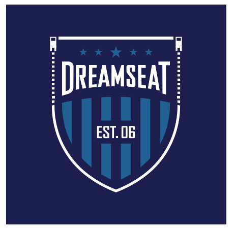
DREAMSEAT NAVY BACKGROUND