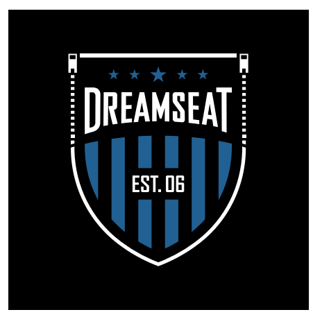
FULL-COLOR - BLACK BACKGROUND