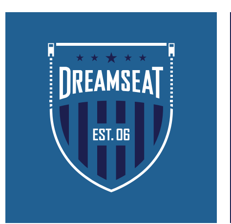
DREAMSEAT BLUE BACKGROUND