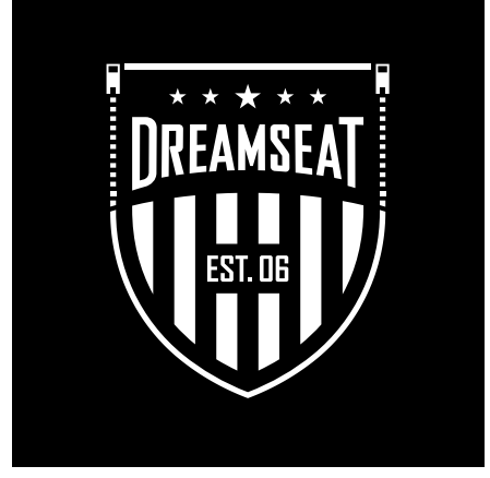
SINGLE-COLOR BLACK BACKGROUND