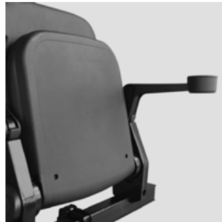
Tip-Up with Cup Holder