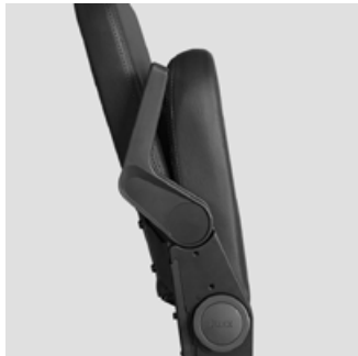
Tip-Up (Optional Auto Tip)