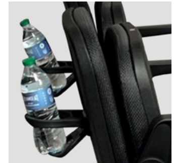
Tip-Up Cup Holder